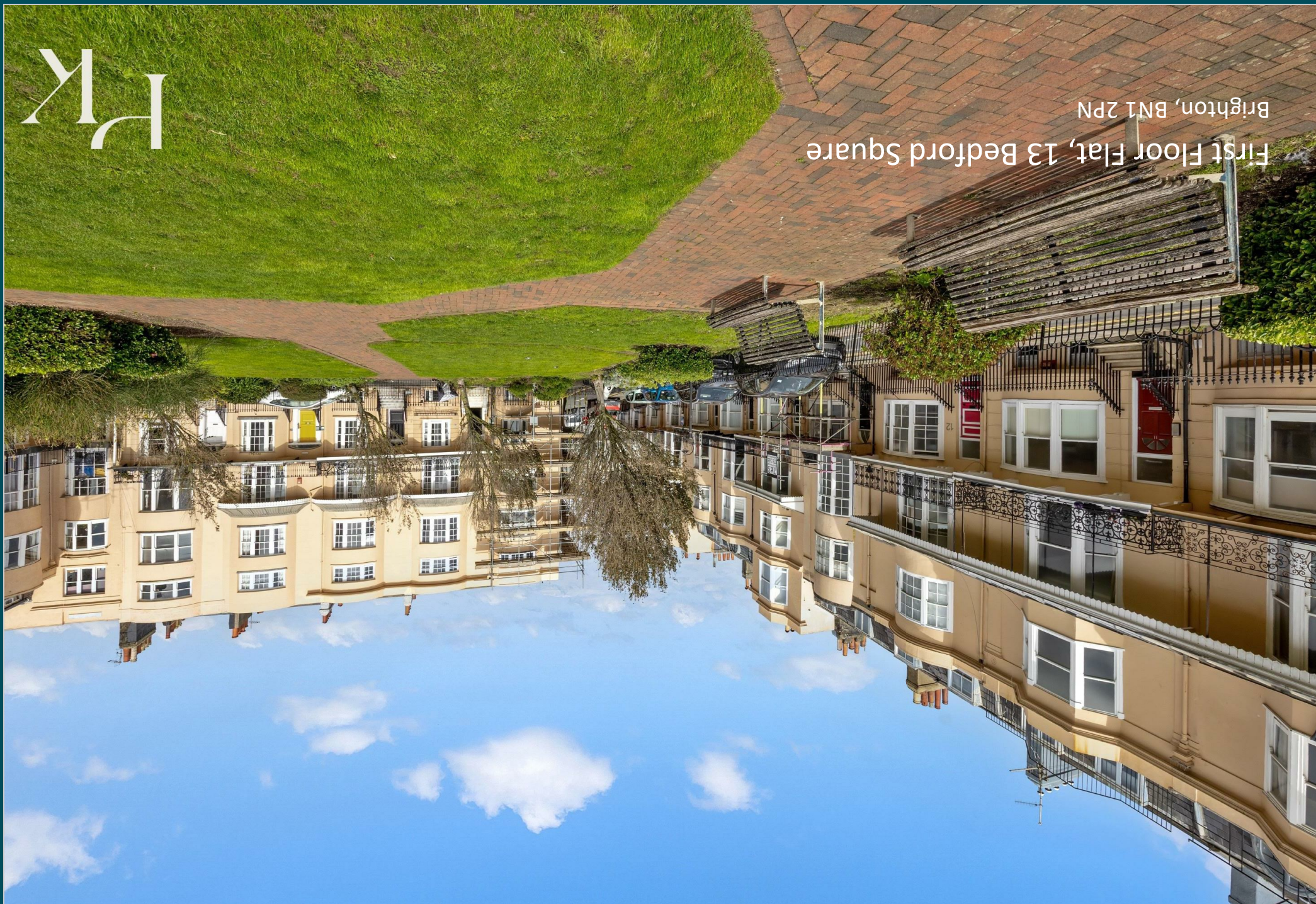
First Floor Flat, 13 Bedford Square Brighton, BN1 2PN